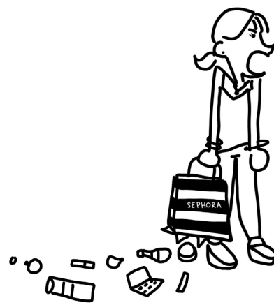
Art by Ayelet Spevack '25, Art Editor

could be because social media apps such as TikTok and Instagram force kids to grow up too fast. When children watch their favorite influencers promote trendy products, they want to follow them. For the preteen epidemic at Sephora to stop, parents need to monitor the content their kids consume. By limiting their social media intake, children will develop at the right pace and won’t feel the need to grow so fast.