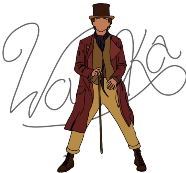
A highlight of the film is the Oompa Loompa storyline. One night, Willy Wonka

Wonka , starring Timothée Chalamet, depicts the origin story of Roald Dahl's Charlie and the Chocolate Factory . Young Willy Wonka dreams of selling his magical chocolates; however, the police immediately shut down his illegal operations after three powerful chocolatiers feel threatened by his extraordinary chocolate and turn him in. Coerced into staying at Mrs. Scrubitt's boarding house, illiterate Wonka signs a contract in which he has to work in her underground laundromat in order to pay off his debt. He meets and quickly befriends five other captives there, deeply bonding with Noodle, a little girl who has worked at the laundromat her entire life.